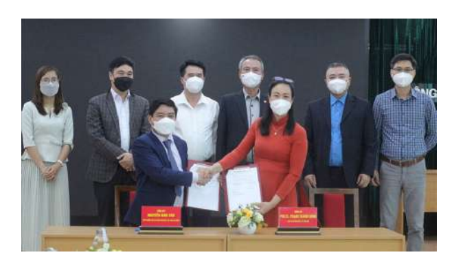
Signing ceremony of the coordination program between VNNIOSH and Vietnam National Union of Health Workers

multiple occupational risk factors; advising on policies on labor health and occupational diseases for trade union members and employees; propagating and training on COVID-19 knowledge and control measures, safe adaptation for union members, health workers and workers in general; strengthen organizational coordination in studying and assessing the impact of the working environment on employment and health of workers in the health sector to serve as