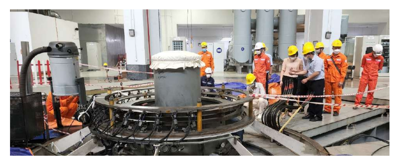
Assessing OSH risks at Son La Hydropower plant

labor conditions to assess the overall impact of factors (physical and non-physical factors) on employees in the workplace, in 2014, in a joint research program between the Vietnam General Confederation of Labor and the Ministry of Science and Technology, VNNIOSH has presided over the implementation of a study to propose a new assessment method, which is suitable to the reality of Vietnam (known as the VNNIOSH-2017 method). This method is built on the basis of the method of the Russian Federation and the current hygiene standards and regulations in Vietnam. Levels of labor conditions also correspond to levels of occupational safety risks. The method of assessing and classifying the quality of the working environment is consistent with the labor conditions. The quality of the working environment sanitation is assessed according to 7 levels (1. Good quality; 2. Acceptable quality; 3. Mildly hazardous; 4. Moderately hazardous; 5. Severely hazardous; 6. Very toxic; 7. Dangerous). These 7 levels are agreed to be equivalent to the labor conditions.