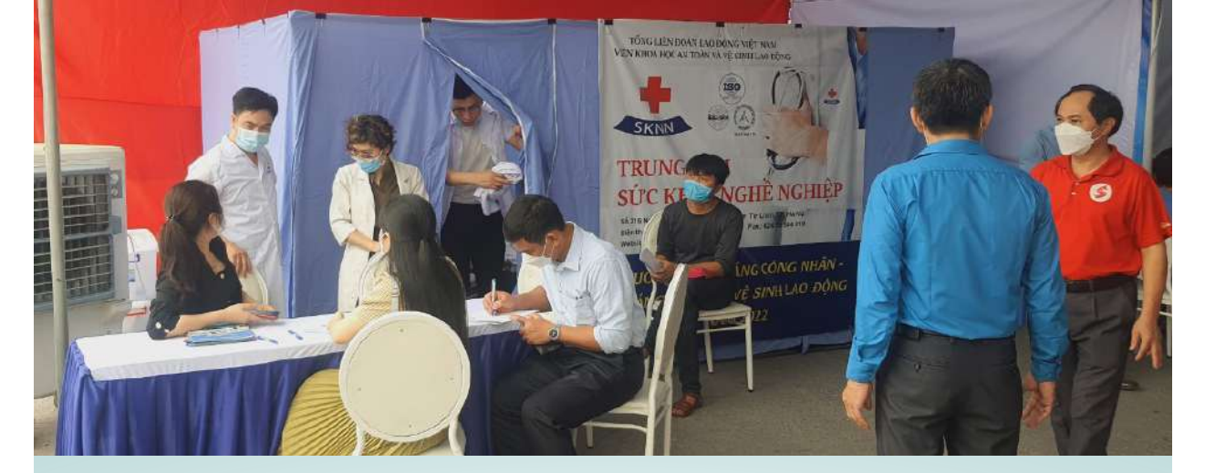
Free occupational health check, consultation and treatment of for workers