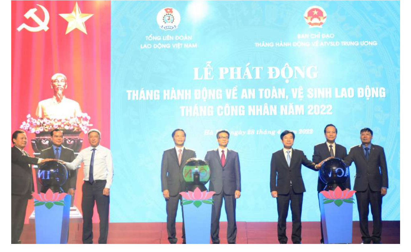
Launching ceremony of the Action Month on OSH and the Workers' Month 2022