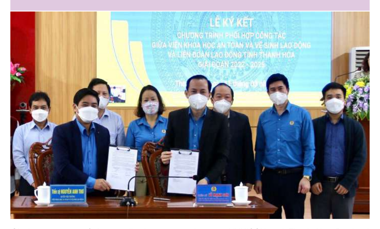
Signing ceremony of the coordination program between VNNIOSH and Thanh Hoa Provincal Federation of Labour

In the first 6 months of 2022, The Vietnam Institute of Occupational Safety and Health (VNNIOSH) signed a program to coordinate the implementation of occupational safety and health with relevant units in order to improve the efficiency of information and propaganda on OSH, care and protection of workers' health.