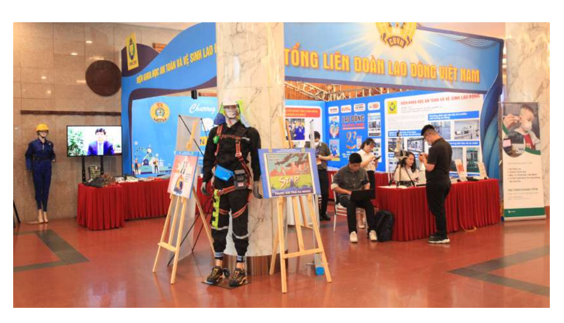
The exhibition booth of VNNIOSH displaying science and technology products at the ceremony to launch the Action Month on OSH and the Workers' Month 2022

The Workers' Month 2022 is launched by the Vietnam General Confederation of Labor to inspire the tradition of solidarity and creativity, and at the same time promote the pioneering role and sense of responsibility of the Vietnamese working class in performing their tasks of socio-economic development well, especially economic recovery and development from the COVID-19 pandemic. The Presidium of the VGCL asked trade unions at all levels to organize practical Workers' Month activities in association with the Action Month on OSH 2022, actively and collaboratively participate in inspection and supervision of the implementation of policies for employees in the context of COVID-19 pandemic prevention and control and socio-economic recovery and development; promoting dialogue, negotiation and signing of collective labor agreements, agreements to ensure welfare, contributing to improving the living standards of employees.